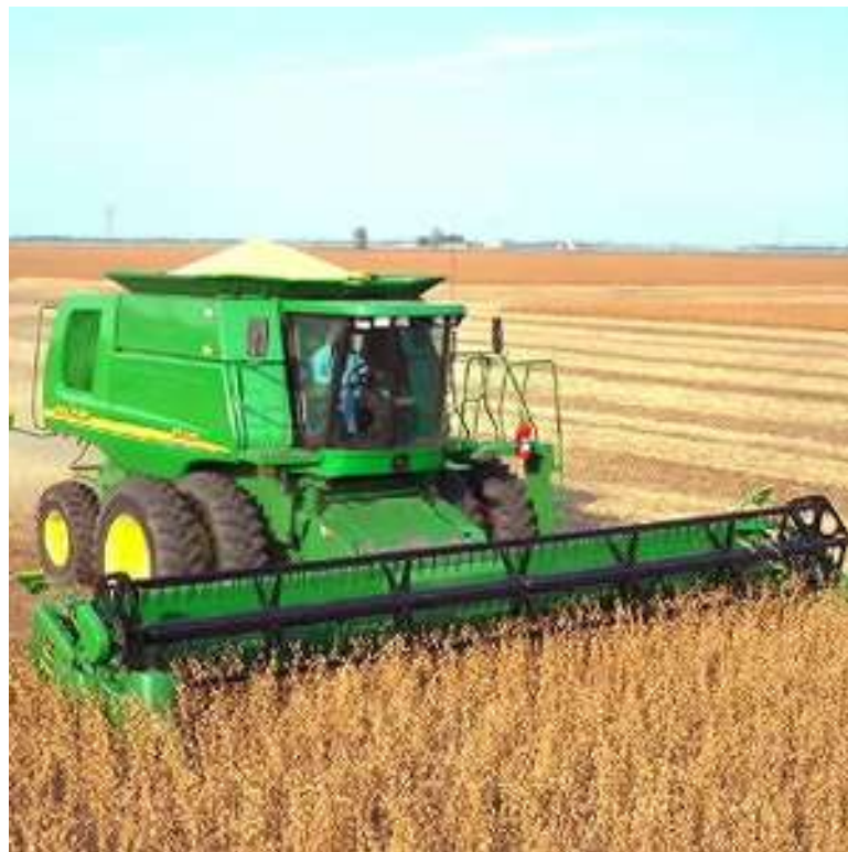
Figure 3: Combine for Deere