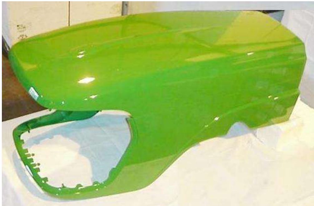
Figure 1: Hornet Hood (Deere)

This compound meets Deere material specifications JDM H22 UP-(GF 28+M44), JDH612, and JDMF11. The compound provides a Class A surface with good paint and bond adhesion properties. Figures 1, 2, and 3 show a variety of parts molded from the SMC for the John Deere applications.