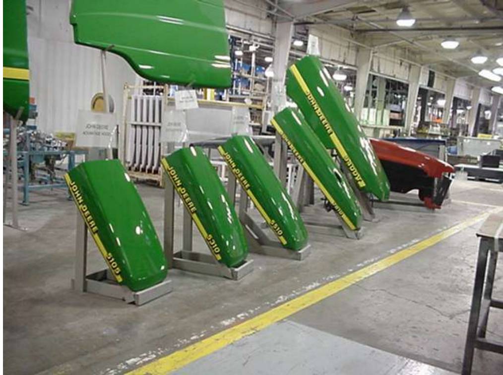
Figure 2: Different Hoods for Deere Tractors