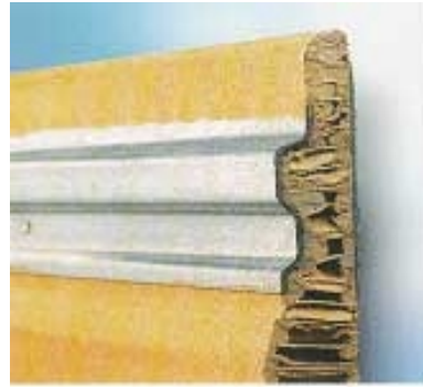
Photo 5. Sandwich Composite with Metal Piece

Photo 5. shows a cut away view of the honeycomb sandwich composite. Notice that this also shows an incorporation of metal brackets integrated into the design.