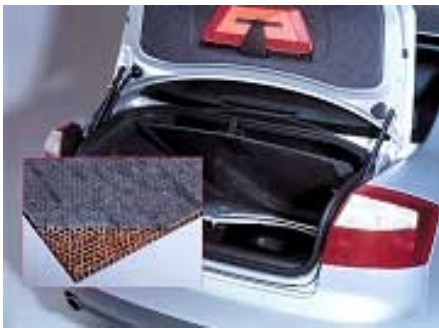
Photo 4. Audi A4 Spare Tire Cover

The Baypreg® F sandwich composite construction is becoming quite popular for sunshade, spare tire covers, and load floor applications. In Europe, this particular composite technology is being used for BMW, DCX, and Audi, to mention a few.