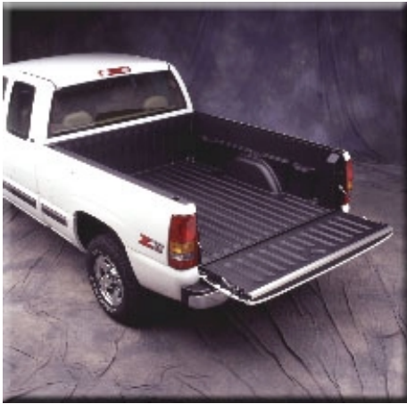
Photo 1. SRIM Composite Box and Tailgate

Also, the Chevrolet Avalanche and Cadillac Escalade EXT SUVs use HD-SRIM composites for their midgate panels. As in the case for interiors, the HD-SRIM technology is lighter weight than steel as well as another composite technology, SMC. The HD-SRIM has demonstrated excellent impact resistance, abrasion resistance, and corrosion resistance for these applications.