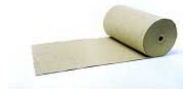
Photo 3. Natural Fiber Mat Roll

The cut-to-size natural fiber mat is picked up by a robot-controlled gripper system (item 5) and conveyed into a booth (item 2). There the Baypreg® F system is applied as quickly as possible (<15 sec) using several mixing heads. The system must be applied to both sides of the thick, impermeable natural fiber mat (cf. Photo 3.) to guarantee complete impregnation in the subsequent pressing process.