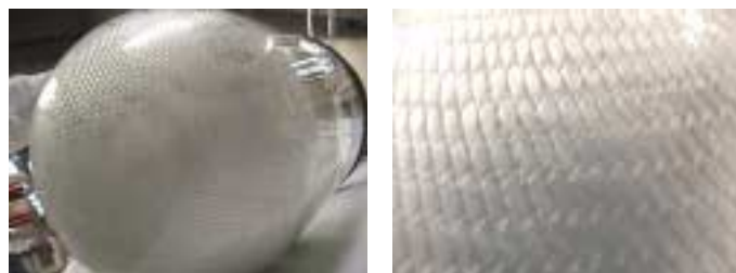
Figure 4. Demonstration of shapability possible with thick 3-D woven fabrics. Left: single fabric ply shaped into a hemispherical mold without wrinkling. Right: close-up of area of highest shear.