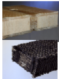
Figure 3 Examples of net-shape and thick one-piece 3WEAVE™ preforms from carbon, aramid and E-glass fibers.